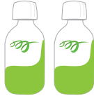
Two bottles of CLENPIQ (5.4 oz each)